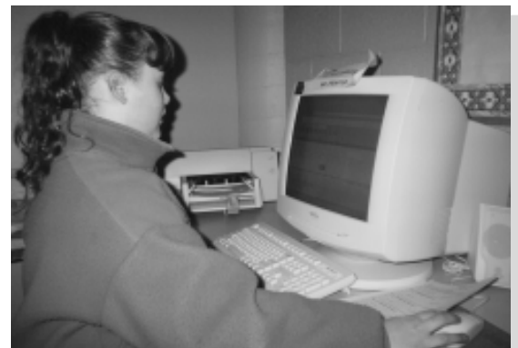
Tracking down a resource

This past year the Bend-La Pine School District provided a unique staff development opportunity for other middle school teachers in the district to learn about Cascade Middle School's exemplary library media program. Grant funds provided the means for teachers in other middle