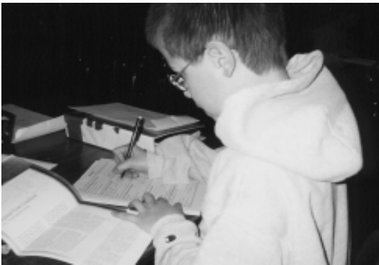
Preparing his bibliography