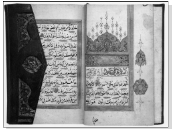
Ritual manuscript en Arabe Contenant Diverses Prieres et Surats du Coran from the Bibliotheque des Langues orientales.

Bibliotheque des Langues orientales. Extracted from Patrimoine des bibliotheques de France , Vol. 1, 1995. Banques CIC pour le livre, Fondation d'Enterprise, Ministere de la Culture et Payot, [Paris]