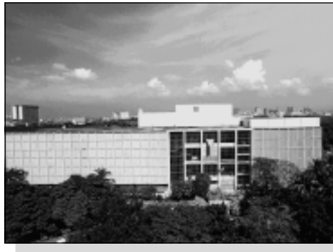
The Philippine National Library.