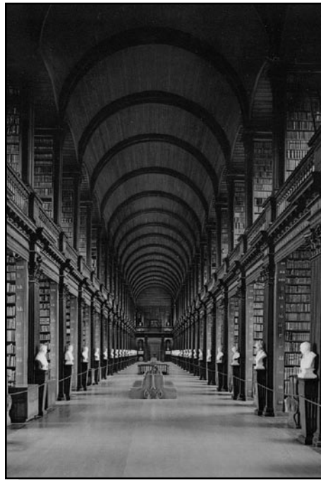
The Long Room, Trinity College Library Dublin.