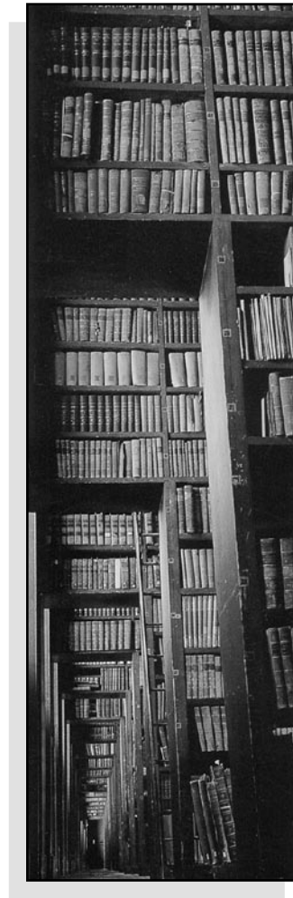
The Long Room, Trinity College Library Dublin.

Wow. Here was the unexpected knock-your-breath-out experience of the kind that keeps me addicted to travel-