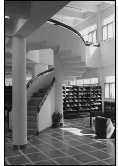
American Studies Research Centre library.

of types of projects, depending on the needs of the host. In addition to India, the 1989-90 Library Fellows were assigned to projects in Swaziland, Norway, Taiwan, Ireland, New Zealand, Jamaica, and Syria. Without exception, the experience proved to be a highlight of everyone's career. Sadly, the program was defunded in 1998.