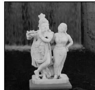
Hindu god and goddess, Krishna and Radha.