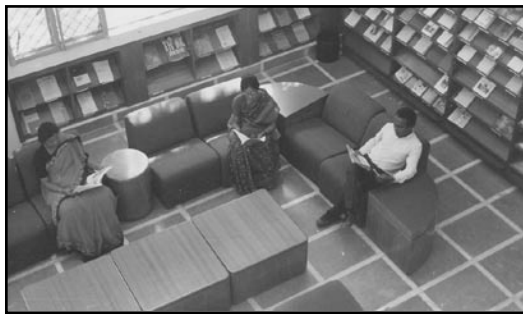
American Studies Research Centre library.

After what seemed like an interminable wait, I received notice that I was a finalist, and then, after a daunting interview in Washington, D.C. with a committee of six or eight