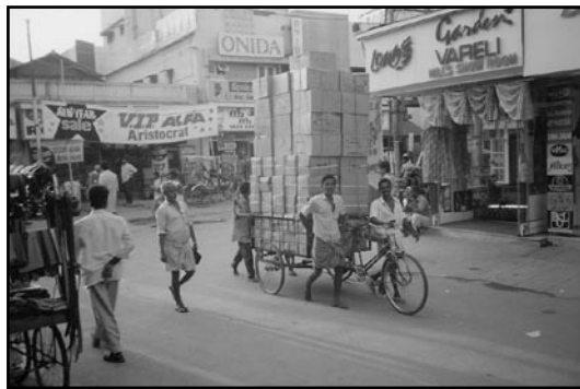
Hyderabad Street scene.

While in India, I also had the opportunity to attend the All-India Library Conference in the "Pink City" of Jaipur, visit the Taj Mahal in Agra and the incredible erotic sculptured