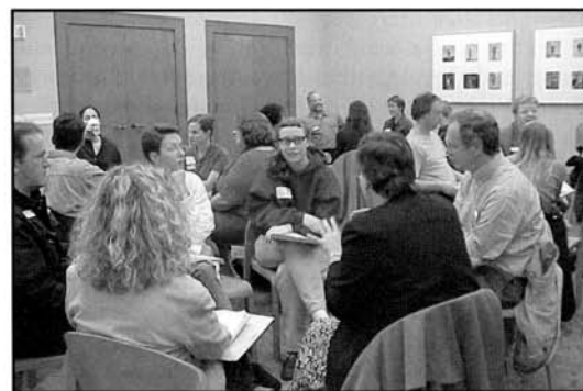
Small group activities are a key component to staff learning sessions.

On July 1, 1998, the MCL libraries increased public service hours by 60 percent. This called for a bold approach to training the new pages, clerks and library assistants that were being hired in large numbers.