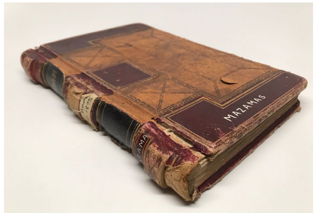
1915 Mount Hood summit register

The two most-used collections in the Mazama archives are the summit register and glacier research collections. For almost eighty years, the Mazamas managed the registers on the summits of all the principal peaks in the Northwest. The logs, many in custom-made aluminum boxes designed and manufactured by the Mazamas, record the names of climbers and the date they reached the summit. The registers also encompass a wealth of observational data on the climate, geology, and glaciology of the mountains on which they resided. Beginning in 1895, the Mazamas undertook scientific research and observations of glaciers around the Northwest. The Mazamas were early pioneers of using aircraft to document glaciers and their movement. Covering roughly thirty years, this collection offers climate researchers a snapshot in time of these Northwest glaciers.