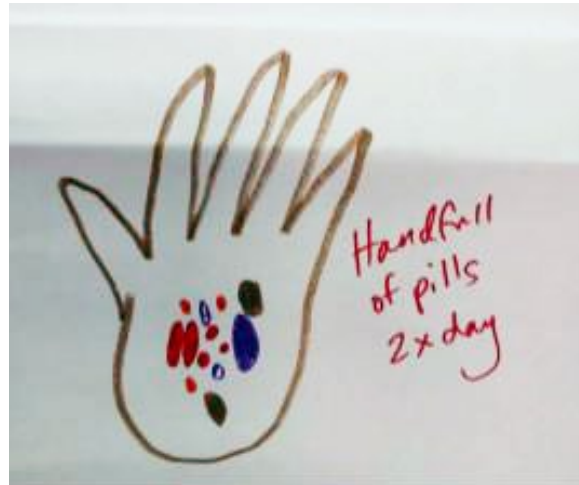
One of the responses to the drawing prompt, "Draw what health means to you."

As patrons become familiar with the program they become its ambassadors, letting new participants know how the sessions work.