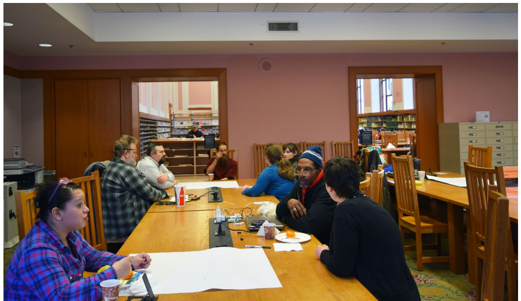
Staff and patrons enjoying Coffee and Conversation.

Multnomah County Department of Human Services & Multnomah County Library. (2013). Homelessness, human services and libraries . Retrieved from http://multnomah.granicus.com/MetaViewer.php?view_id=3&clip_id=733&meta_id=46718