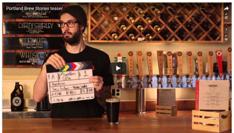
Screenshot from the video teaser for Portland Brew Stories. Used under license from Hopstories.