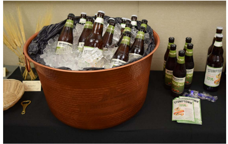
Beer! At the library! Just some of the beer being served at the Portland Brew Stories kick-off event.