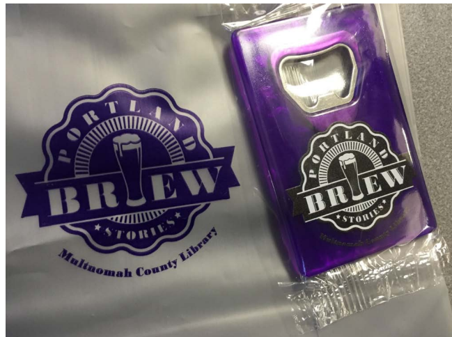
Branded tote bag and bottle opener from the Portland Brew Stories kick-off event.

The Portland Brew Stories collection went live on the library website in early February 2016, and a kick-off event attended by 63 library patrons was held at the Central Library on February 11. Staff from five breweries were on hand to distribute tasters of their beer (beer drinking is not typical at library events, and required more-than-usual planning and