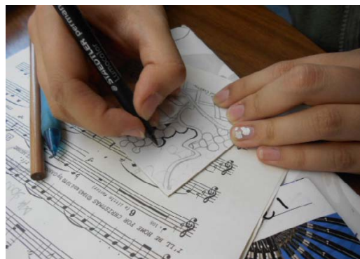
Close up of a Zentangle.

I wanted to see the program open up to anything in the “arts.” So I approached people at the Coos Art Museum who directed me to the Bay Area Artists Association. I shared my idea with the assistant Directors of both the Coos Bay and North Bend Public Libraries. I was looking to tap into the interests of the high schools fandom community. Students talked excitedly about Enochian, Gleeks, Whovians and other groups they followed. That did not pan out the first year, but this year students stepped forward to present. They advertised their session as a Fandom Gathering . The fandom sessions doubled participation the first night.