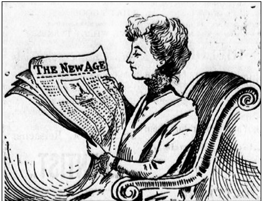
Image from page five of The New Age , June 29, 1901.