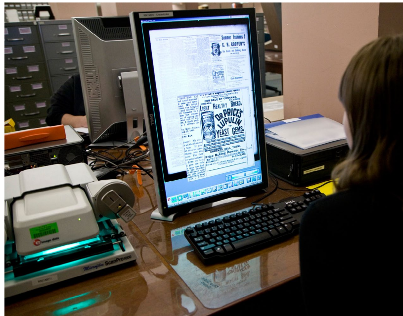
A patron uses a ScanPro machine to view historic newspaper content on microfilm in the UO Knight Library.

Up until recent years, those wishing to delve into the historical record provided by old newspapers had to venture to a physical library and scour stacks of printed pages or microfilm reels to find what they were looking for. The University of Oregon Knight Library houses an extensive collection of both historic and contemporary Oregon newspapers on microfilm through which students, faculty, and members of the public can peruse at any time during the library's hours of operation. Inter-library Loan has allowed us to share our collection with library users near and far, but with some limitations; reels can only be used by one person at a time, and access to microfilm readers continues to impede usability.