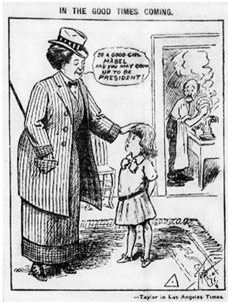
A political cartoon, published on page one of The Madras Pioneer on July 20, 1911, reveals that although much progress has been made in the past 100 years, society has remained the same in many ways.

Looking through historic newspapers online is like looking backwards and forwards in time simultaneously. It is almost impossible not to make comparisons between the content and views expressed in historic papers and the way things are today, leading to thoughts of what the future might bring. It can be shocking to see how much our world has changed,