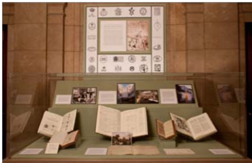
Exhibit at the Frick Art Reference Library.

11 a.m. on Saturdays. Registration is painless, especially if you present your library employee ID. Exhibitions showcase the library's extensive holdings and change regularly. After browsing the stacks, the reading room is an ideal place to relax and leaf through books filled with glorious art plates.