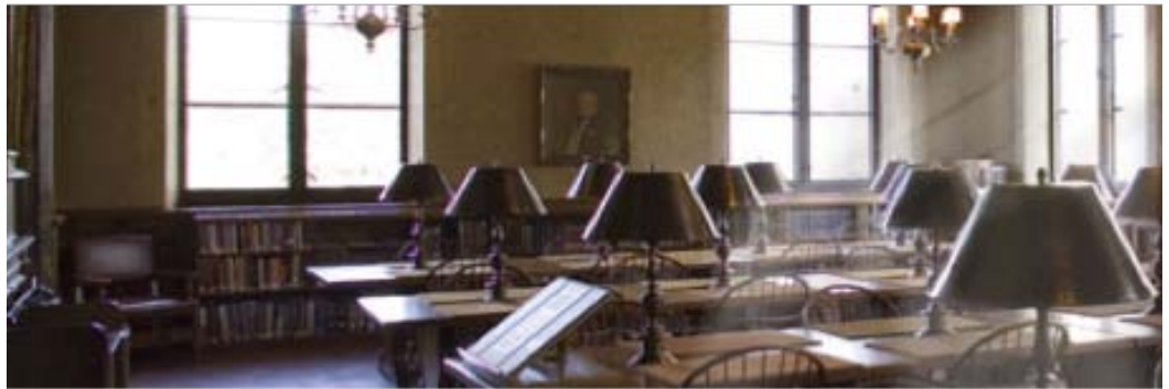
The serene reading room at the Frick Art Reference Library.

Soon after Frick's death in 1919, his daughter, Helen Clay Frick, founded the library in her father's memory. At first, the library was located in the home's bowling alley, but within four years, the collection moved to a newly constructed building on the site. This building soon proved inadequate for the growing collections and plans were made to construct a thirteen-story library. The current building, immediately adjacent to the Frick Museum, officially opened to the public in 1935 and still houses the collections today.