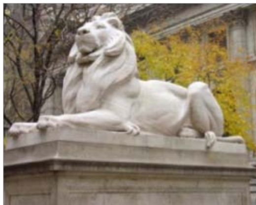
Patience, one of two lions flanking the main entrance to the New York Public Library.

With these resources in place, plans moved ahead to merge Astor’s and Lenox’s libraries with Tilden’s trust fund and create a new entity: The New York Public Library. The organizers of the new library envisioned a landmark building, to include a capacious reading room and seven floors of stacks. The beautiful marble building opened to the public in 1911, sixteen years after initial planning began (Reed, 1986). The architecture reflects the vision the creators had of “library as temple of learning.” As Reed writes, “one cannot imagine New York without it” (1986, p.x i).