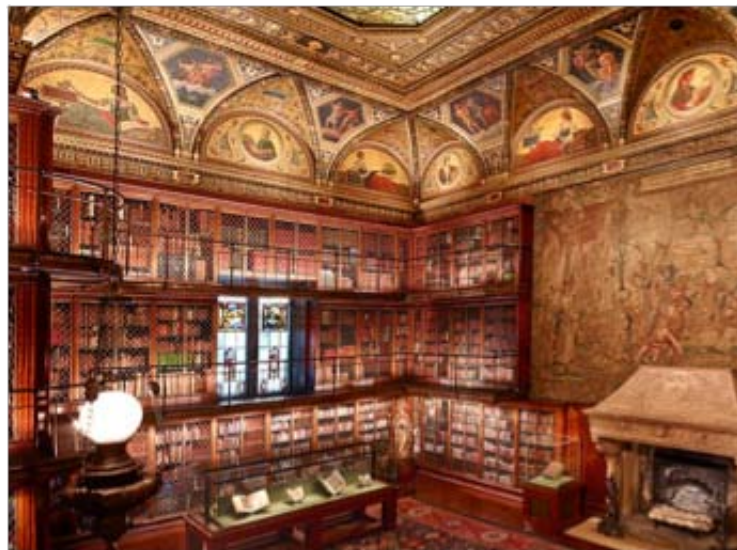
The original Morgan library, now the East Room.

John Pierpont Morgan was born into a banking family in 1837, and leveraged his background and connections to become a wealthy financier. By the early 1890s, he was one of the United States' most prominent citizens, both lauded and hated. Morgan started to collect books, paintings, and other art objects at an early age. In 1902, his home no longer had the space to contain all his literary materials, so he commissioned a library to be built adjacent to his residence. The design was inspired by the European model of a gentleman's library. There is evidence that from early on, Morgan planned that his collections would be made "permanently available for the instruction and pleasure of the American people" (Pierpont Morgan Library, 2000, p.18).