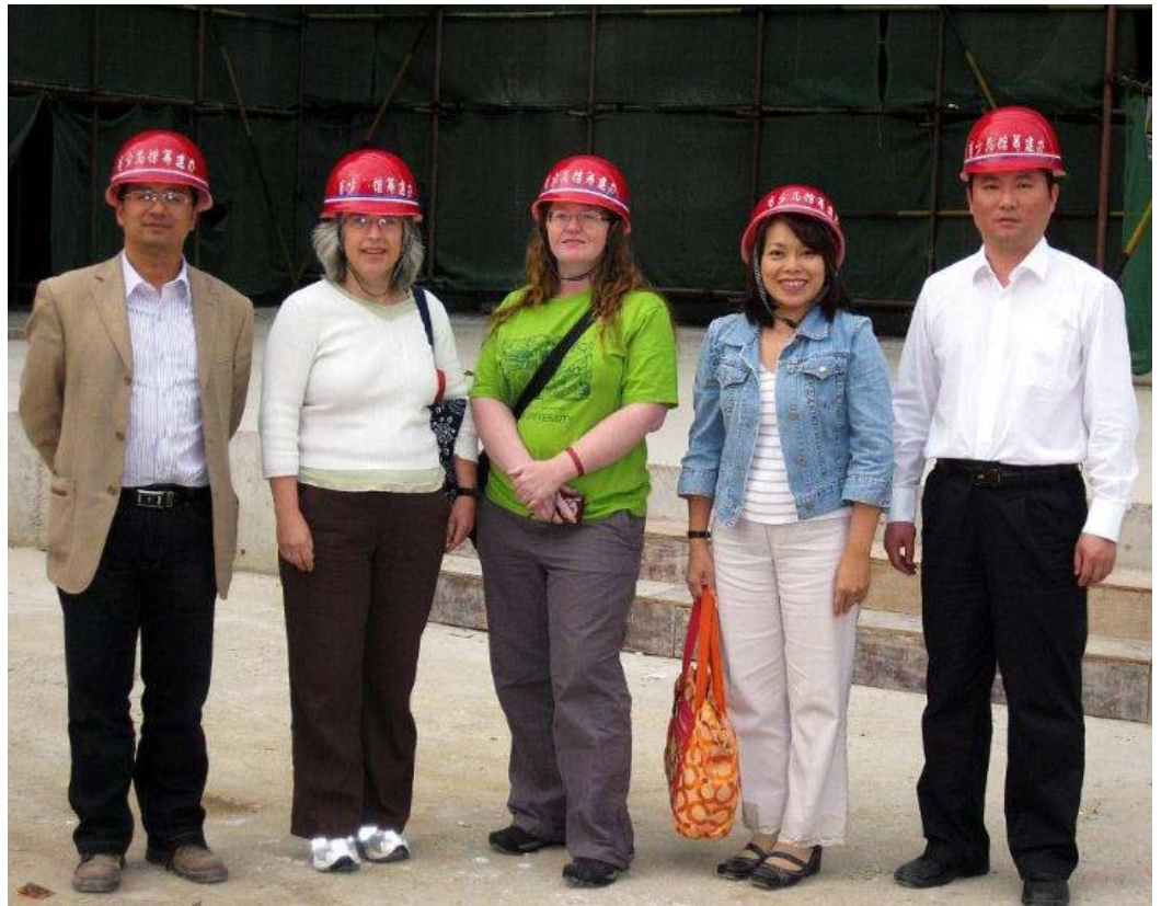
Group picture in hard hats on site of the Fuzhou Children's Library.

The biggest difference is charges for services. Patrons at the Xiamen Public Library must put down a deposit of 400 Yuen ($60.00) before borrowing books, a minimum of 50 Yuen is good for checking out two books, and you cannot check out books that exceed the value of your deposit. The reasoning is that there are no collection agencies in China. We were vocal in explaining that this is an unnecessary barrier for patrons and that losing a few books is