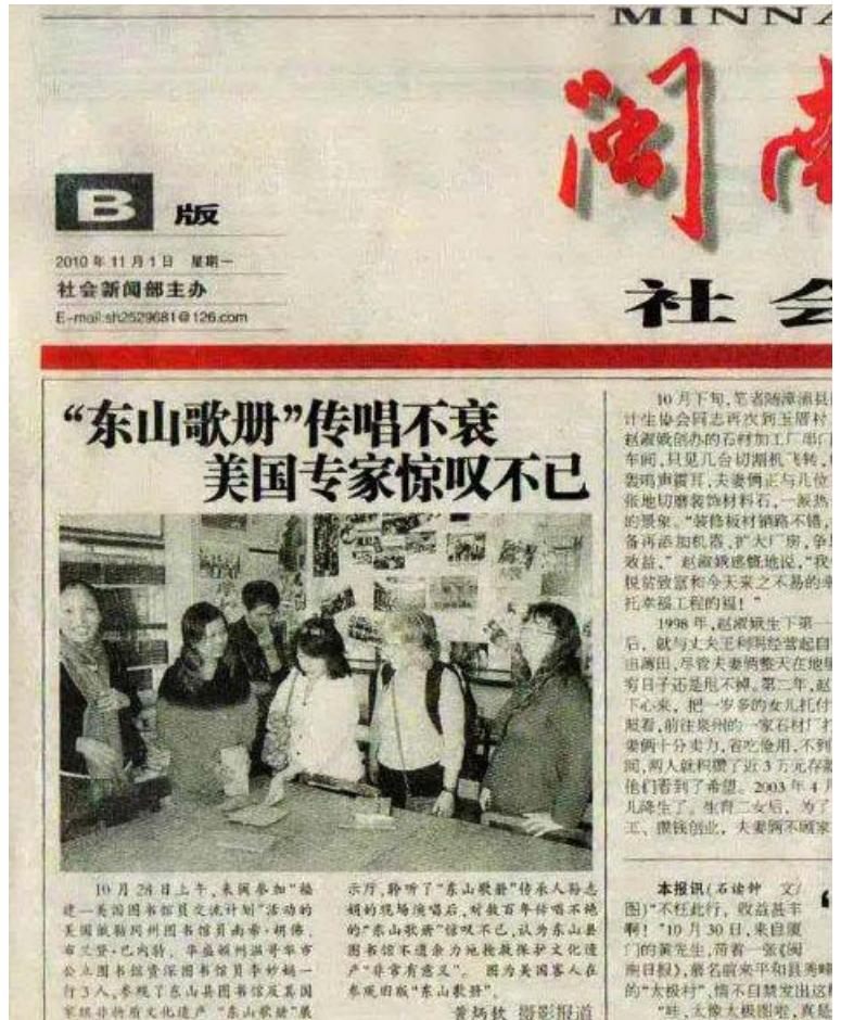
Librarian’s visit from the U.S. make news in Dongshan.

Most people in China do not have cars. Traveling to a downtown library can take citizens as much as two hours each way on the bus. The Guangkuo community library “station” was created as a partnership with the Xiamen Public Library. It is a small library in a residential complex of 16,000 people, situated in a spare room of the local government / social service agency office. When the agency is open during work hours, patrons enter through the agency and a social service employee can help them check out a book. The “librarian” is a social service employee who runs the library on the side; staff takes turns volunteering to open the library room on weekends. This is quite an investment for the community workers and extra work for them to meet the information needs of their community. Xiamen Public Library supplies them with books, DVDs, and periodicals, but does not contribute money for staffing or capital expenses like furniture and computers; these are paid for with donations from the community. However, the government is now seeing the benefit of these stations and will be adding financial support to the public library’s budget next year.