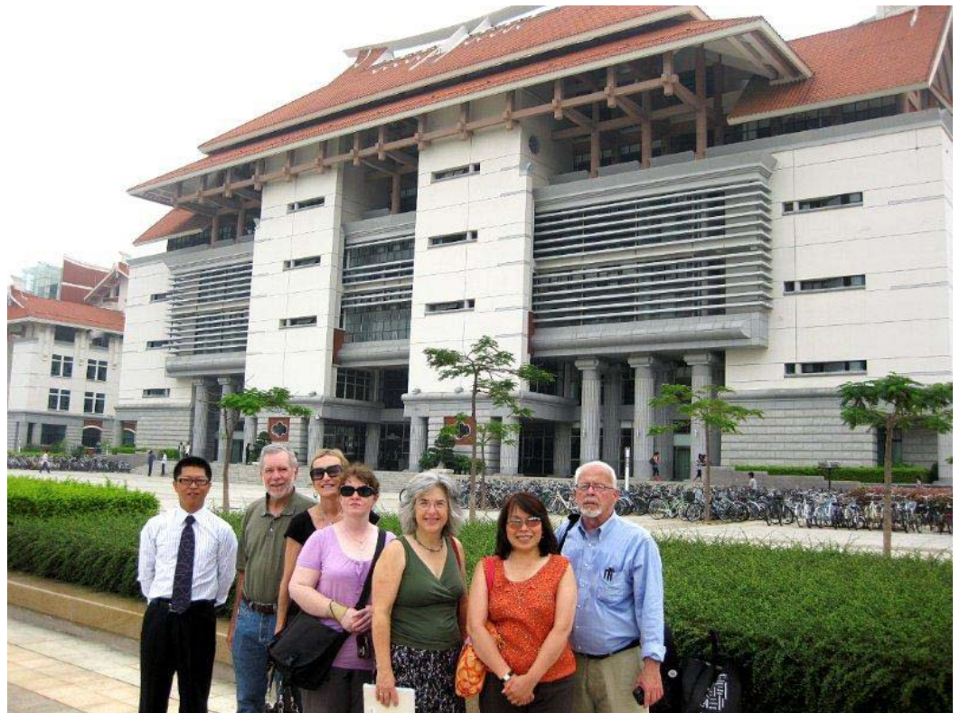
Xiamen University – Zhangzhou Campus Library.

One of the most impressive things about the public library districts we visited is their outreach to their millions of constituents. We saw many hard working people, who were often volunteering time on their days off, using creative partnerships with local governments and industries to bring libraries to the people.