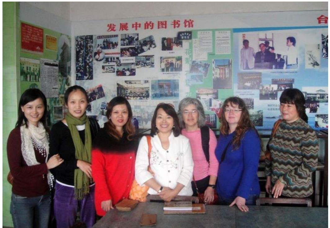
Dongshan Public Library staff and guests.

What will the next round of Horner librarians find when they venture to China in 2013? They will certainly see all the completed libraries that were construction sites when we visited (with hard hats on) or the new buildings and expansions that are in the planning phases right now. Clearly the government is seeing the value of libraries in society and they are funding them. China wants and needs an educated population. The hard working Chinese librarians can take credit for this support because of the positive impact they are making in their communities. 🌿