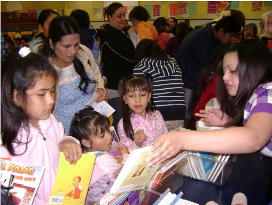
How to choose the best book.