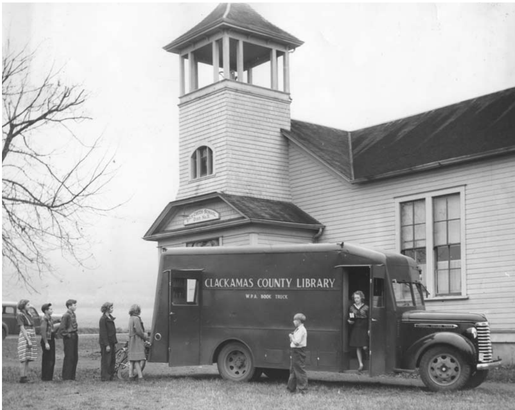
Clackamas County Library Book Truck, circa 1940. Students at the Rock Creek School are lined up to enter the county book truck funded by the Works Project Administration.