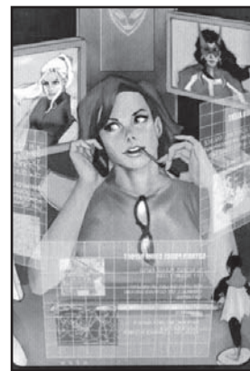
Barbara (Oracle) Gordon at work

for her costumed colleagues. Barbara is a pioneer, arguably the first digital librarian. She's also a rare example of a disabled superhero, operating ably from a high-tech wheelchair, and coordinating the work of the all-female super-team, the Birds of Prey.