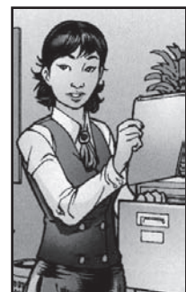
Xi'an "Shan" (Karma) Coy Manh

Over at Marvel Comics, another librarian lurks amongst the colorful costumes. Introduced in 1980, Xi'an "Shan" Coy Manh is a Vietnamese refugee and a mutant superhero. Originally a member of the unfortunately named "New Mutants" (effectively the junior X-Men), she has the power to seize control of other people's minds. As Karma, Shan was the first field leader of the New Mutants.