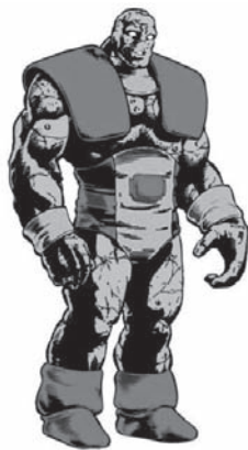
Blok © DC Comics