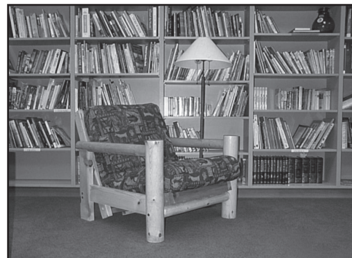
A comfortable and quiet place to read with easy access to books.