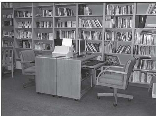
The two new computers with Internet access for Tribal members.